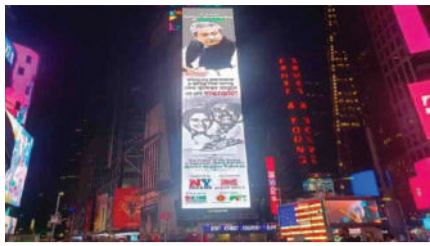
Bangabandhu's life sketch being showcased at NYC's Times Square